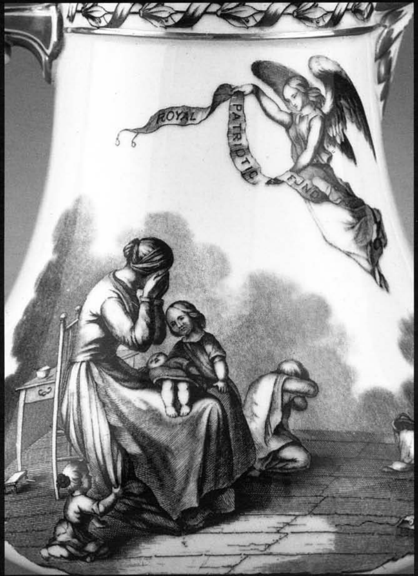
FIGURE 2: Detail of Transfer Print on Porcelain Jug, Staffordshire, c. 1855, showing a grieving widow during the Crimean War (Private collection).

through both television coverage and subsequent photography of the aftermath (fig. 8). Although this fragment of the great wreckage was indeed a powerful physical artifact of the destruction, Erickson drew a parallel with a technique used 200 years earlier by Josiah Wedgwood. Erickson's choice of jasper as the medium for this work has significance beyond the symbolic comparison with Wedgwood's ruined column.