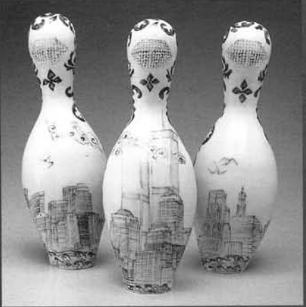
FIGURE 8, LEFT: Ruin by Michelle Erickson, 2002. Jasperware, H.17" FIGURE 9, ABOVE: Garniture by Michelle Erickson, 2002. Porcelain with underglaze cobalt decoration. H.14" (Courtesy, The New-York Historical Society). FIGURE 10, OPPOSITE PAGE: Liberty by Michelle Erickson, 2002. Tin-glazed earthenware. H.16" Photographs by Gavin Ashworth.